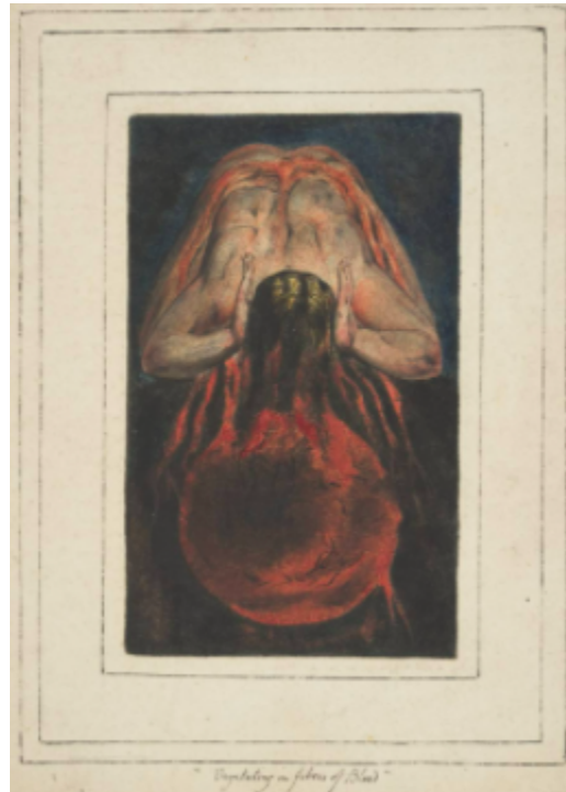
From The Book of Urizen , William Blake c. 1818